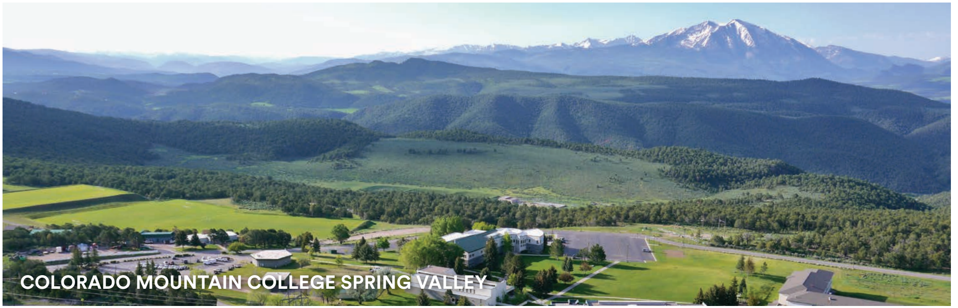
COLORADO MOUNTAIN COLLEGE SPRING VALLEY