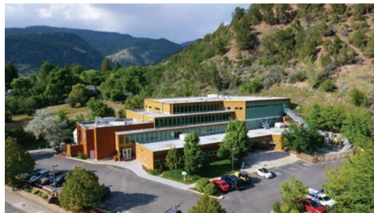
CMC GLENWOOD SPRINGS